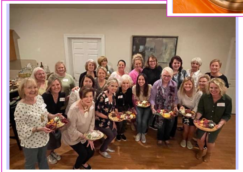
Phi Mu Sisters learned a new skill, enjoyed the social and philanthropy event!!